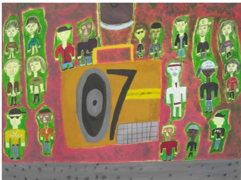
Kyle Cooke, "Rappers 07"