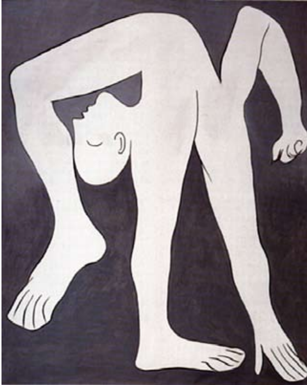
Pablo Picasso, "The Acrobat."

Many people think that there is no connection between visual art and anatomy. However, artists of all times have studied anatomy to create realistic images of humans in their work. The ability to create a life-like image of a person became less important with the discovery of photography. Nevertheless, artists still study anatomy and use their knowledge of anatomy in their works, but in a different way than before. The importance of relating art and anatomy is to understand the true message the painter wants to transmit so that observers can have their own interpretation similar or