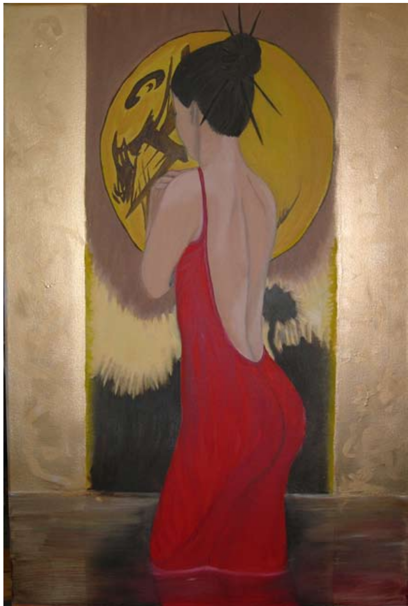
Elayne Vanderbilt, "Geisha Rising"