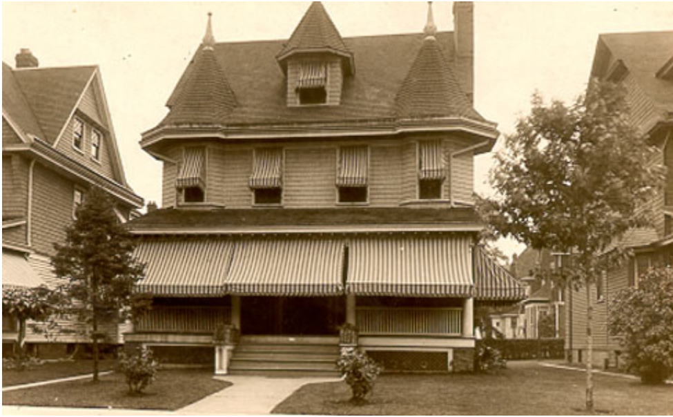
Read Family home, 745 Rugby Road, Brooklyn NY, 1904