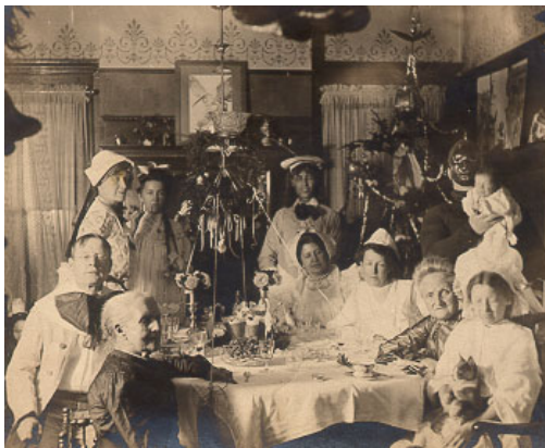
Dutch Costume Party, Read home, 745 Rugby Road, Brooklyn, Christmas 1904