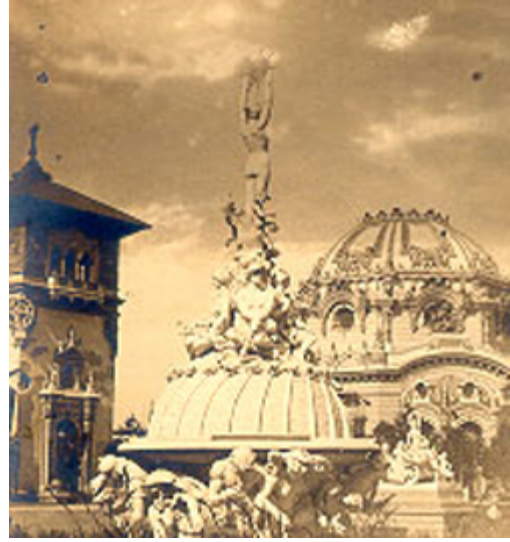
Pan American Exposition