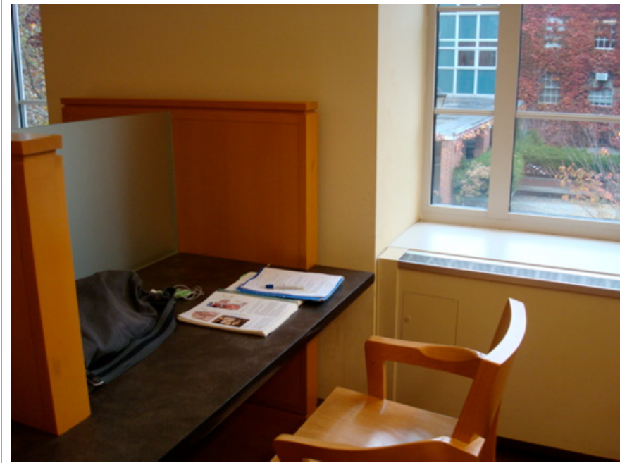
FIGURE 2 Student Photo of Study Carrel at the Brooklyn College Library

Yeah, the carrel desk. 'Cause it's, like, uh, I have, like, some privacy which is, uh, a thing lacking at ... So, I have some kinda privacy when I study in those types of things.