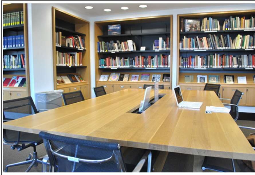
FIGURE 4 Student Photo of the Hunter College Art Library

within the CUNY system. These libraries often had been renovated or remodeled more recently than students' home college libraries; they sometimes contained additional amenities such as specialized lighting and comfortable seating. All of these combined to create a more scholarly, "serious" library atmosphere that these students preferred to what they experienced at their home college libraries. This accords with research at diverse institutions such as the University of Rochester, 34 the University of Illinois Springfield, 35 and the University of Maryland, University of Arizona, and University of Illinois Urbana-Champaign, 36 which has revealed that, for many students, a traditional academic library full of books and formal furniture provides a serious setting that they found encourages and supports their academic work.