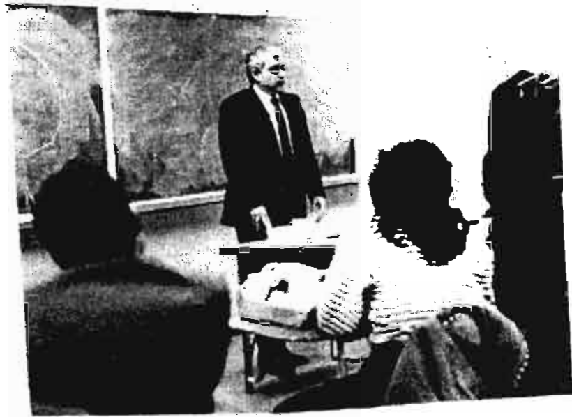
Consul General of Cyprus at LaGuardia