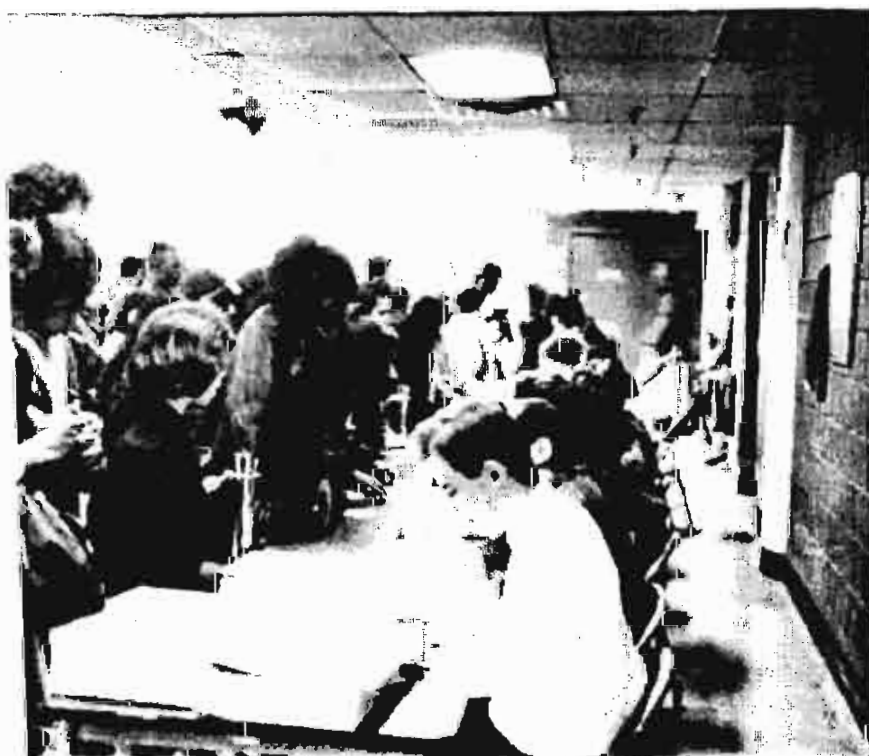
Students line up for aide.