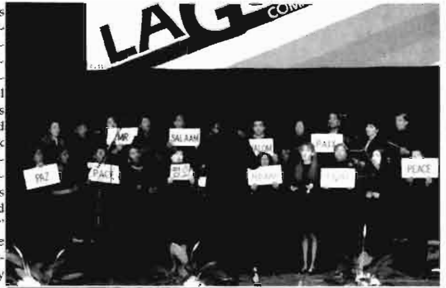
LaGuardia students with a message of peace.