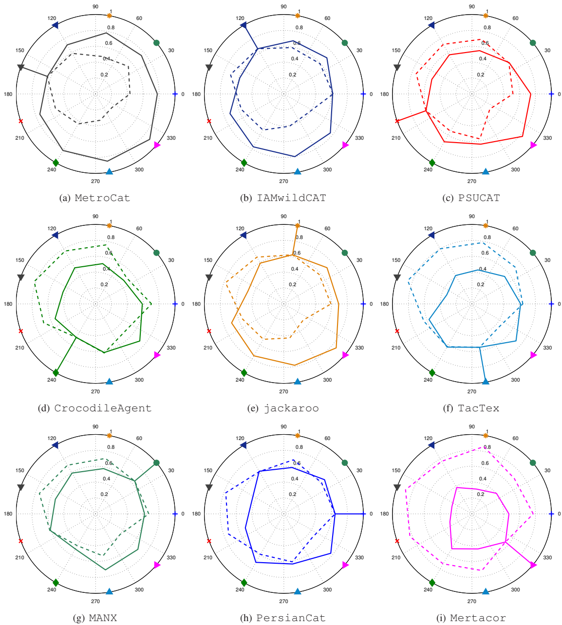
Figure 3: Payoffs of self and opponents in bilateral CAT games. On the outer circles starting from polar angle 0^\circ lists the 9 specialists anti-clockwise : PersianCat ( 0^\circ ), MANX ( 40^\circ ), jackaroo ( 80^\circ ), IAMwildCAT ( 120^\circ ), MetroCat ( 160^\circ ), PSUCAT ( 200^\circ ), CrocodileAgent ( 240^\circ ), TacTex ( 280^\circ ), and Mertacor ( 320^\circ ). The radial coordinates of the 9 vertices of a solid-line polygon represent the corresponding specialist's payoffs against the 9 specialists respectively, and those of a dashed-line polygon represent payoffs of its opponents respectively. The overlapping vertex of the two polygons in each sub-figure is the self-play game for the particular specialist.