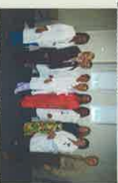
"Travelling EBP Mentors", Shared workgroup.