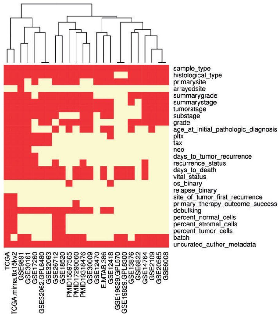
Figure 2. Available clinical annotation. This heatmap visualizes for each curated clinical characteristic (rows) the availability in each data set (columns). Red indicates that the corresponding characteristic is available for at least one sample in the data set. See Table 2 for descriptions of these characteristics.

using the Normalizer function of the Sleipnir library for computational functional genomics (37), and FULLVcuratedOvarianData , which does not collapse redundant probe sets targeting the same gene transcript but instead provides a probe set to gene symbol map in the featureData slot of each ExpressionSet.