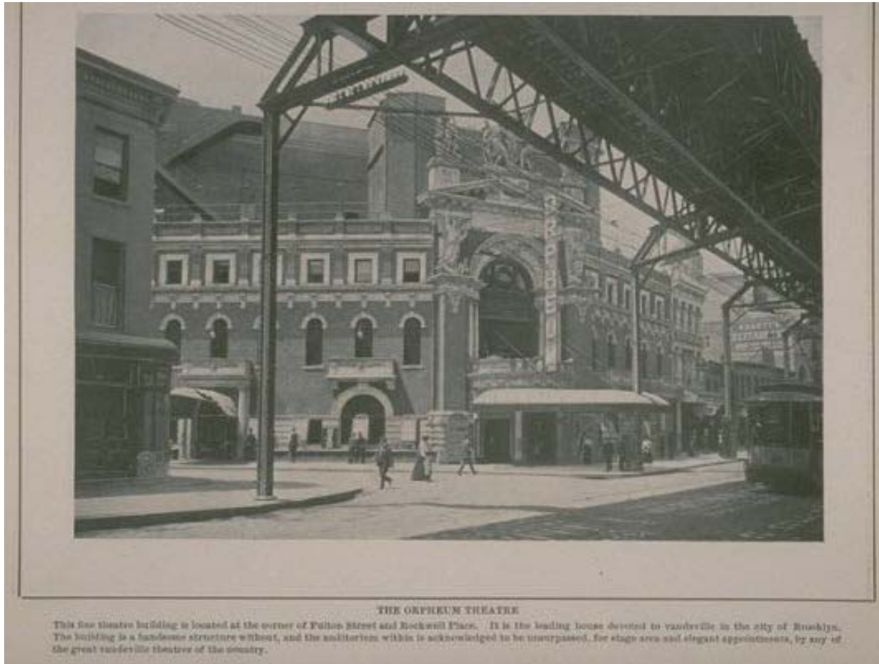
THE ORPHEUM THEATRE

This fine theatre building is located at the corner of Fulton Street and Rockwell Place. It is the leading house devoted to vaudeville in the city of Brooklyn. The building is a handsome structure without, and the auditorium within is acknowledged to be unsurpassed for stage area and elegant appointments, by any of the great vaudeville theatres of the country.