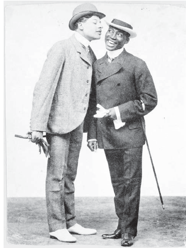
Photograph of Bert Williams and George Walker, reproduced in James Weldon Johnson's Black Manhattan