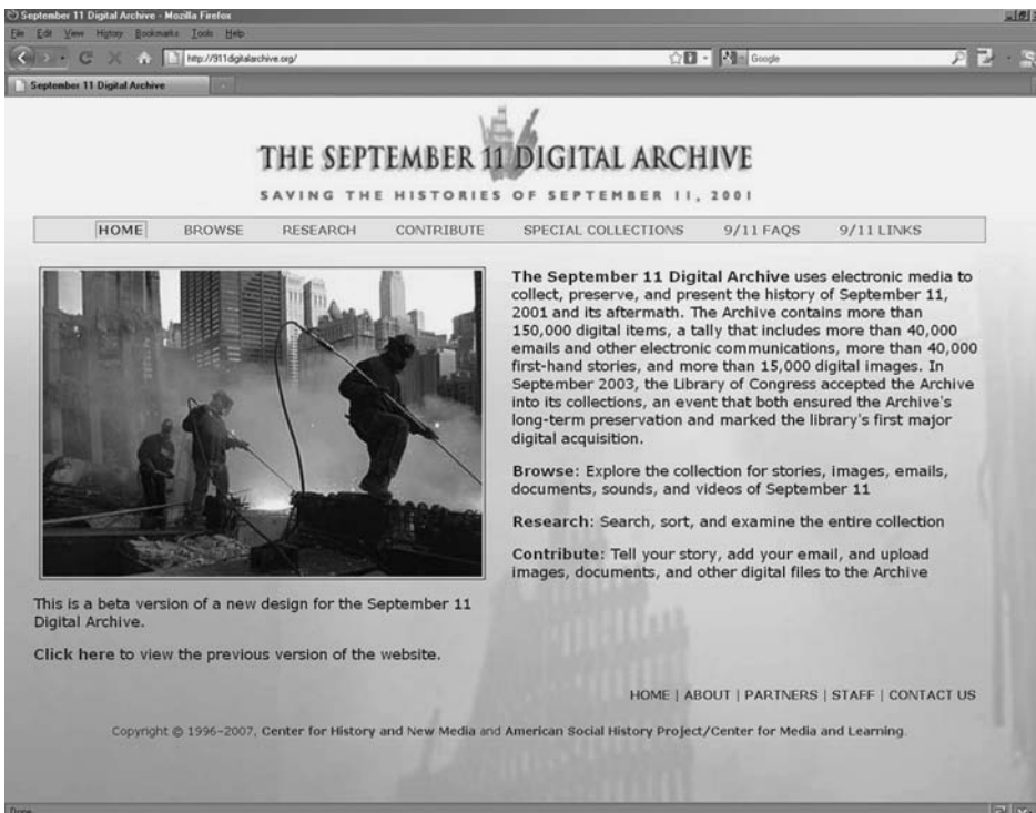
The September 11 Digital Archive home page ( 911digitalarchive.org ) in January 2011

into how people immediately experienced September 11, how it shaped their subsequent behavior and beliefs, and how they came to interpret the meaning of those events in their lives. We also decided to seek out and secure for the archive various listservs and Web logs (blogs) that discussed September 11. 5