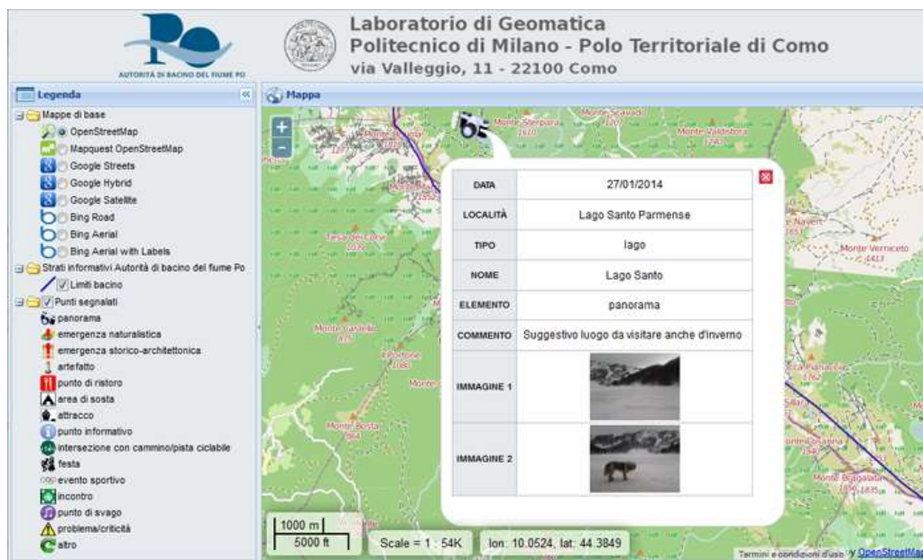
Figure 3. Web visualization and query of the water-related elements reported by users.

published as a Web Map Service (WMS) layer. Finally a Web viewer was developed through the JavaScript libraries OpenLayers ( http://openlayers.org ), GeoExt ( http://geoext.org ), and Ext JS ( http://www.sencha.com/products/extjs ) which provides intuitive access and interaction with this WMS layer representing the reported water-related elements (see Figure 3). A number of base maps served by commercial providers (OpenStreetMap, Google, and Bing) can be used as background maps within the viewer. The layer showing the boundary of Po river basin (in blue) can be also turned on/off in the layer tree. The layer of water-related elements was properly styled through the SLD (Styled Layer Descriptor) standard [16] so that different icons (the same used also in the ODK Collect form) identify the different types of water-related elements. When a reported element is clicked, a WMS GetFeatureInfo request is performed and a popup shows the information originally entered by the user during form compilation. Map browsing within the Web viewer is finally aided by some ancillary OpenLayers controls placed in the bottom left corner of the map panel, i.e. a scalebar, an indicator of current map scale and a tool displaying the coordinates of the mouse pointer as it is moved about the map.