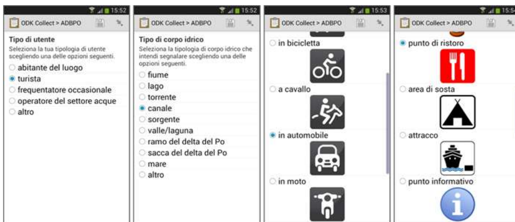
Figure 2. Screenshots of the ODK Collect application showing some steps of form compilation for reporting water-related elements.

Forms compiled by users are sent to ODK Aggregate and their contents are stored in the synchronized PostgreSQL database. Thanks to the PostGIS spatial extension ( http://postgis.net ), user reported data can be read by the spatial Web server GeoServer ( http://geoserver.org ) and