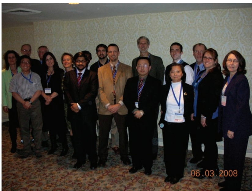
Our picture shows, from left to right:

"...the organizations will run international conferences on alternate years to ensure a well-paced and accessible conference calendar."