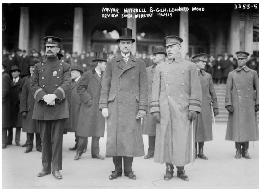
Mitchel and Leonard Wood, January 1915

In mid-February Major John P. Mitchel boarded a train at Grand Central Station headed for San Diego with his wife. For the next two months the former mayor of New York City would learn to fly various small planes and was soon performing barrel rolls and other maneuvers. Mitchel was next ordered to Gerstner Field near Lake Charles, Louisiana. It was tough duty. The base was remote and the Louisiana summer heat oppressive. Still Mayor and Mrs. Mitchel made the best of the difficult situation. Things were going routinely until a training exercise on 6 July. His instructor remembered that Mitchel did a few basic maneuvers until losing control of the small aircraft. Then, he saw Mitchel tumble from the plane. Investigators later determined that he was not strapped in to the seat belt. Death was instantaneous.