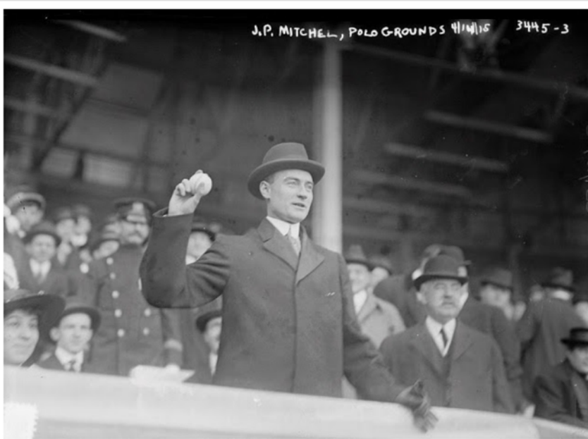
Mitchel at Polo Grounds, April 1915

John Purroy Mitchel died one hundred years ago today. Mitchel served as mayor of New York City from 1 January 1914 to 1 January 1918 and joined what became the Army Air Service days after leaving office. He was killed in a flight training exercise in Louisiana on 6 July 1918, two weeks shy of his thirty-ninth birthday. John P. Mitchel is less well known than figures like Jimmy Walker and Fiorello La Guardia, but New York’s “Boy Mayor” embodied his time in office just as much as his two successors personified the period of the Roaring Twenties through the end of the Second World War.