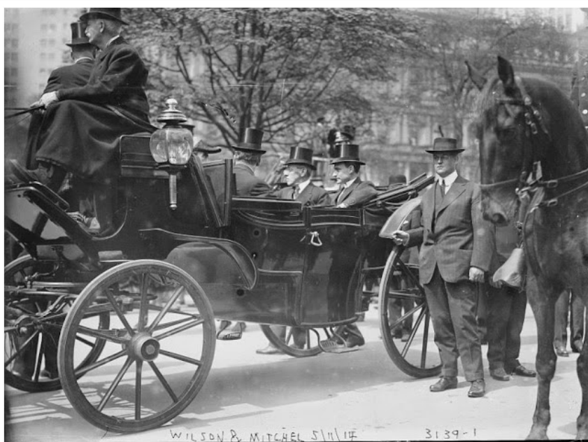
Mitchel and Wilson, May 1914

1899, and graduated with honors from New York Law school in 1901. He quickly rose in politics, earning a reputation as an idealistic reformer unafraid to take on Tammany Hall. In the 1900s he helped Mayor George B. McClellan Jr. weed out corruption and held increasingly important posts into the 1910s. In 1913 Woodrow Wilson nominated Mitchel for the Collectorship of the Port of New York. He served in that capacity for about five months until stepping down with Wilson's blessing to run for mayor. Mitchel ran on the Fusion ticket and was a popular candidate who drew support from such powerful sources as Wilson and Theodore Roosevelt. John Purroy Mitchel won in a landslide and at thirty-four became second youngest mayor of New York City.