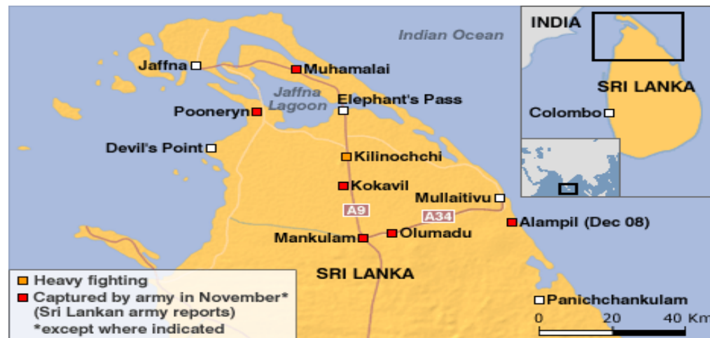
Map 5.2: Main conflict areas in the LTTE-controlled areas.