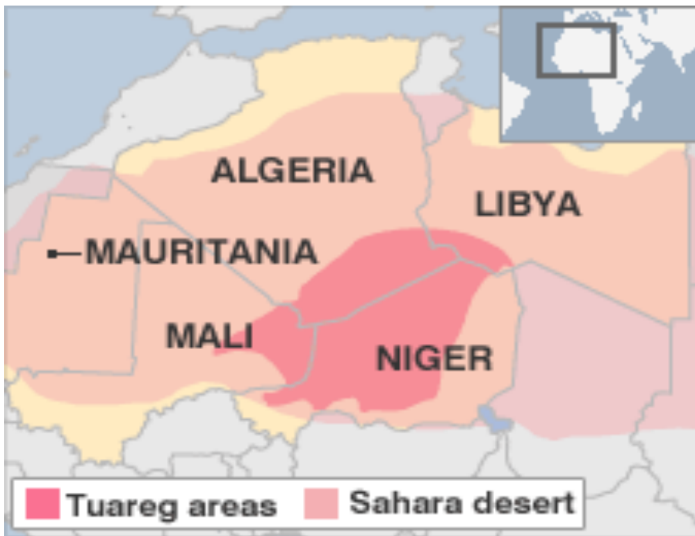
Map 4.5: Tuareg-populated areas in West Africa.

government, which were usually met with repressive measures. Their traditionally held