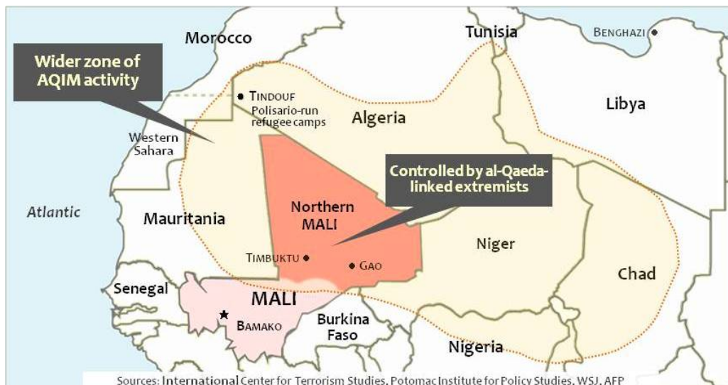
Map 4.2: Map shows AQIM influence in the Sahelian areas.

All three AIGs are located in areas that are far from the seat of government power. AQIM and its allies control roughly 300,000 square miles, in the northern areas of land-locked Mali, out of a total 478,839 square miles (see Map 4.2). 4 The northern areas are home to approximately 1.3 million people of a total population of 4 million.