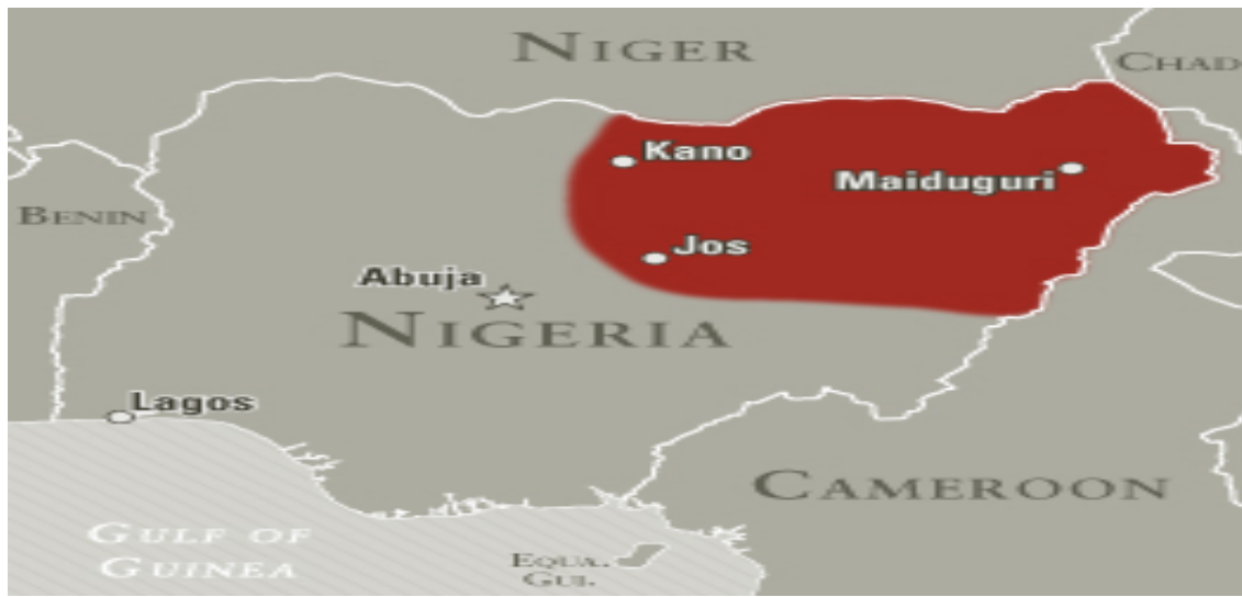
Map 4.3: Map of Boko Haram's influence in Northern Nigeria.