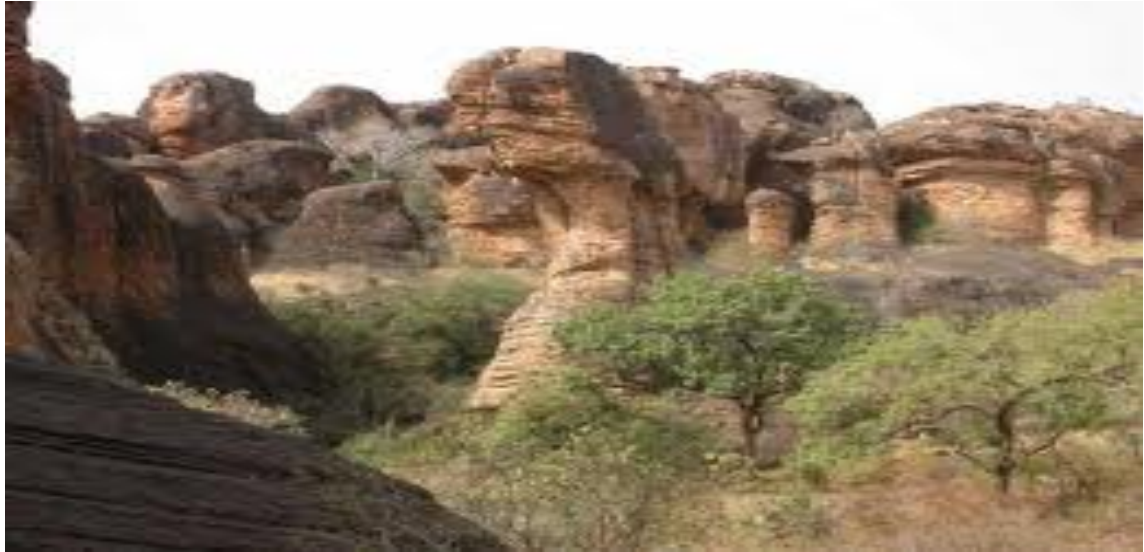
Map 4.1: Mountainous areas of the Adrar des Ifoghas.

The operational bases that the AIGs inhabit are varied, but are strategically beneficial to their cause. The topography of selected terrains can play an important role in preserving and protecting the AIGs from authorities. This holds true for AQIM and Abu Sayyaf, though not for Boko Haram, which relies on carving out “safe havens” within the city limits of Maiduguri to use as its operational bases. So, in this case, “ungoverned spaces” would refer to the non-physical definition.