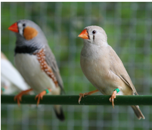
Figure 1. A female zebra finch with a wild type male finch visible in the background.

Using artificial nest predation experiments, here we tested whether captive zebra finches (Fig. 1), a known facultative intraspecific brood parasite both in the wild (Birkhead et al. 1990; Griffith et al. 2010) and in captivity (Schielzeth and Bolund 2010), would preferentially parasitize a nest containing conspecific eggs or a nest containing heterospecific eggs (from a related estrildid species, Bengalese finch, Lonchura striata vars. domestica ). If zebra finches can recognize egg phenotypes and base a parasitism decision on the perceptual distance between the potential host's egg and their own egg's phenotype, or on generally desirable egg attributes (e.g., larger egg size, Tinbergen 1951; or color, Honza et al. 2014), we would expect preferential parasitism of either the nest containing conspecific eggs or the nest containing heterospecific eggs. Alternatively, incipient parasites may not discriminate between nests containing con- or heterospecific eggs. Indiscriminate laying could occur if facultative parasitism following nest destruction is simply a response to the need to lay physiologically committed eggs into active nests that may contain eggs. Such indiscriminate laying could predispose a species to engage in facultative and, eventually, obligate interspecific brood parasitism.