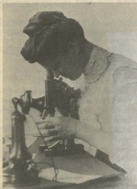
Women and Science: PAGE 4