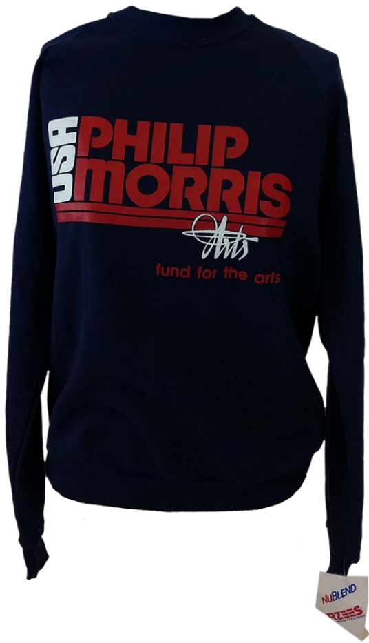
Phillip Morris Fund for the Arts Sweatshirt (1990)

https://csts.ua.edu/files/2019/05/1990-Phillip-Morris-USA-Philip-Morris-Fund-for-the-Arts-2-658x1030.png