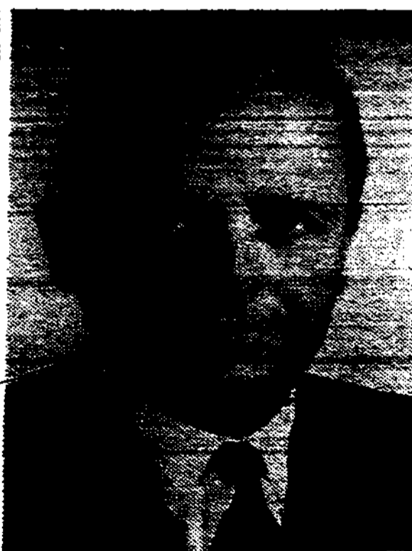
J. Peter Grace

Mr. Grace's career as an officer of W. R. Grace and Company started in 1942 when he was elected secretary. A year later he was named one of the company's di-