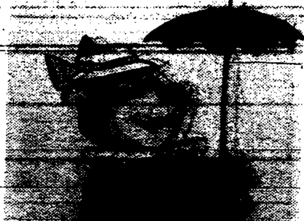
A Female Freshman

A second project to be adopted by F.O.S. is a "Topsy-Turvy Day" in which the freshmen will perform the duties of seniors. F.O.S. feels that such a change will be good for the morale of the freshmen. During "Topsy-Turvy Day" F.O.S. plans to have the freshmen perform such senior privileges as cap