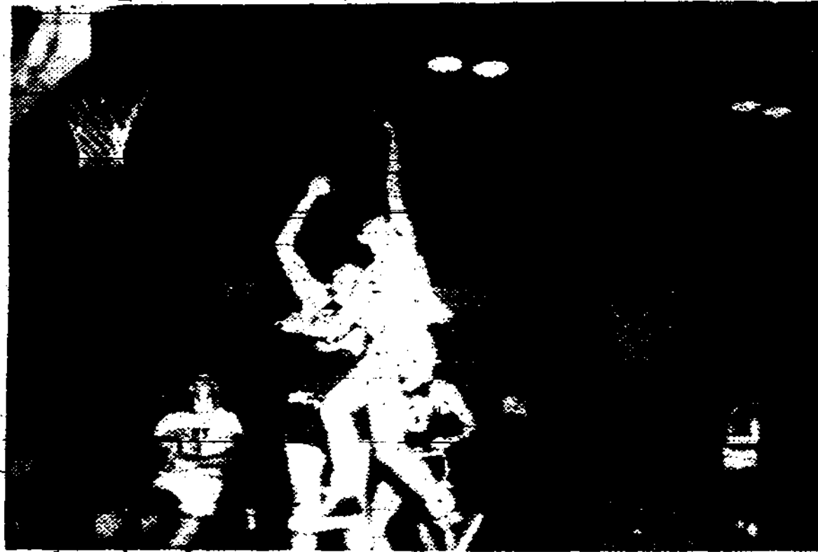
The Great Ones in Action