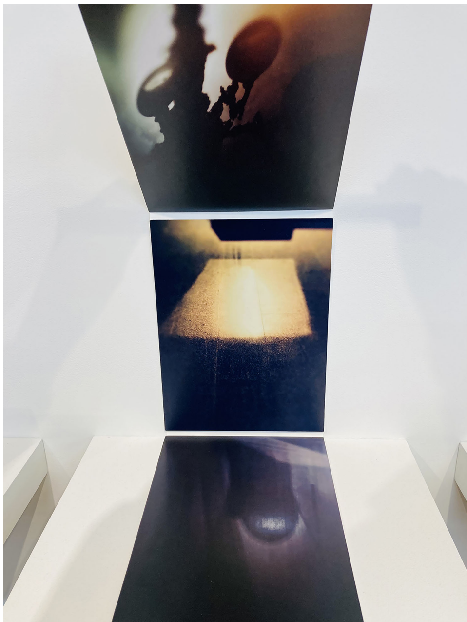
IMAGE 4. Folio 2, unfolded, of Dark Matter (2020) by Maureen Catbagan; courtesy the artist.

it allows us to feel and sense the dynamics that undergird racialization rather than imagine that race coalesces neatly into individuals or populations. Through Muñoz we can sense racialization as a relational structure whose impacts are not only sociological but that unfurl into more nebulous realms.