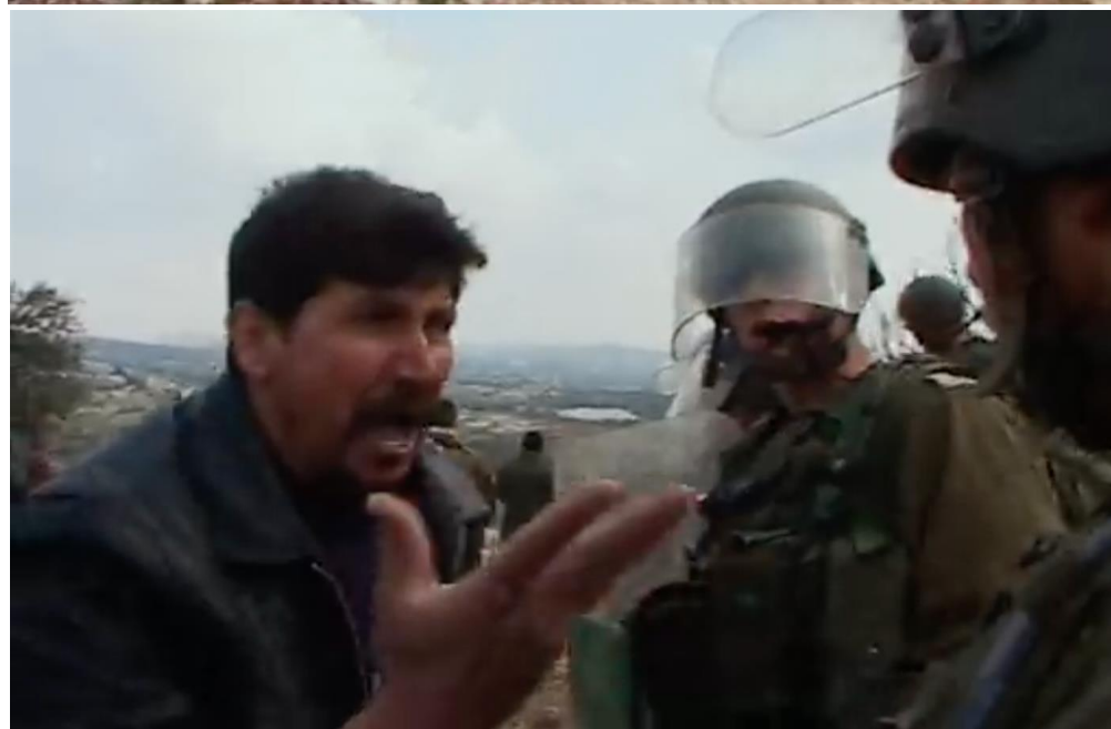
Daba Confronts Israeli Soldiers