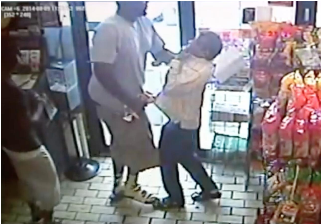
Michael Brown takes the “Cigarillos”