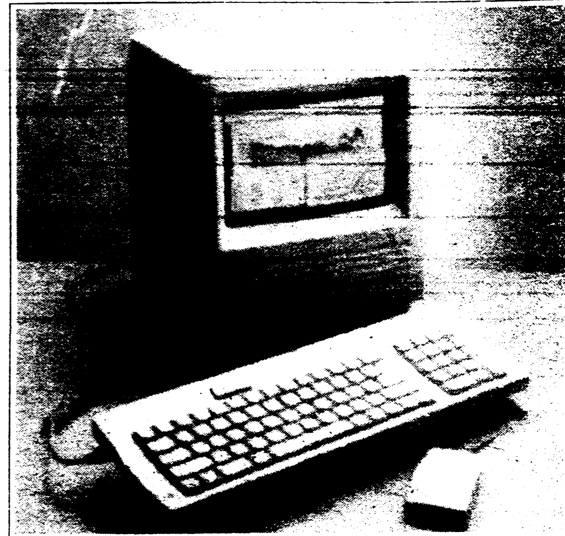
The culprit: Apple's Macintosh is taking over.

According to The Wall Street Quack, this new addiction is classified as a disease. People everywhere are becoming addicted to this little small beige box with a