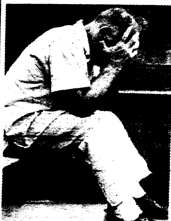
A victim of Mac-aholism.