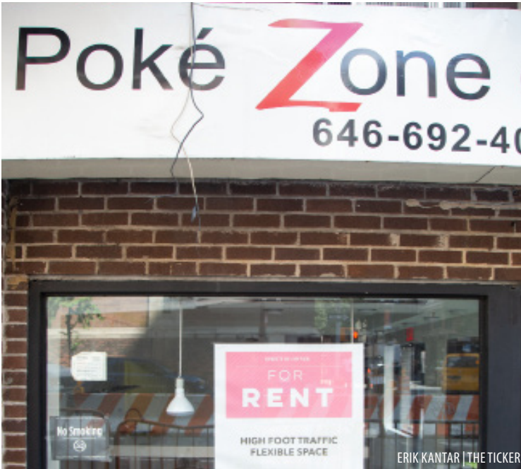
Gramercy businesses are quickly learning that they must evolve to stay afloat.