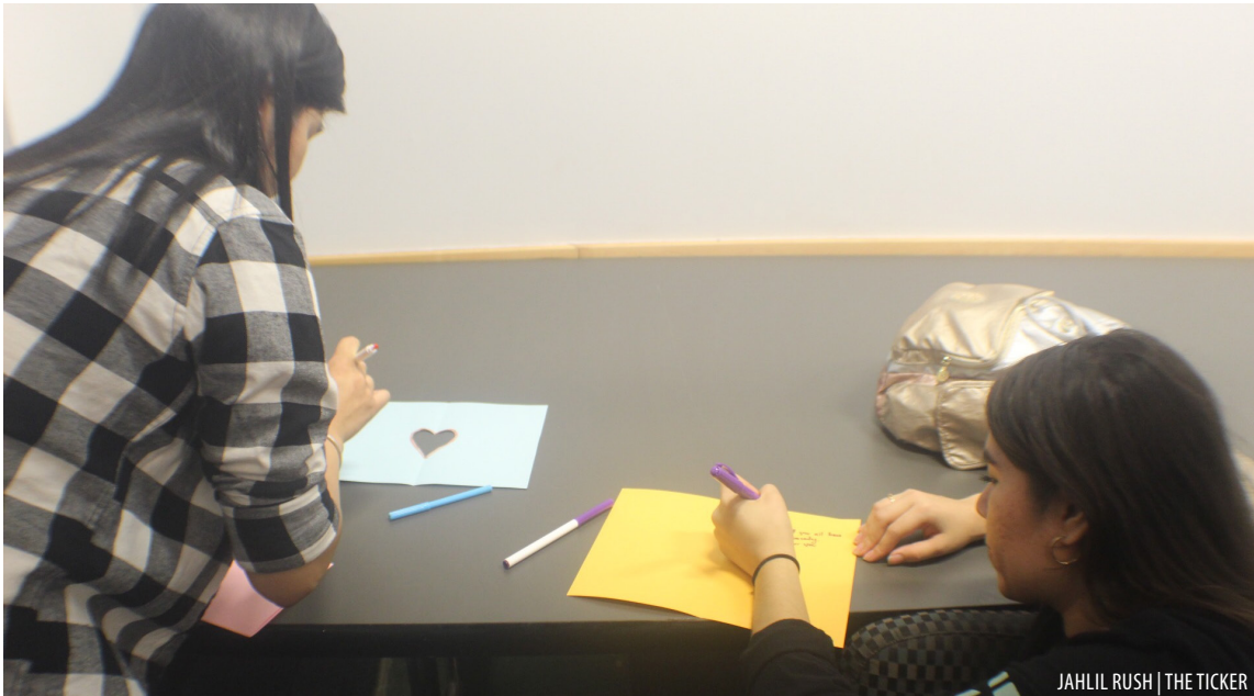
Students of Alpha Phi Omega write letters to 9/11 responders as a tribute to the tragic event that occurred 18 years ago.

To end the evening, the APO e-board thanked everyone who came out to create a thank you card for the 9/11 responders that they will be sending out.