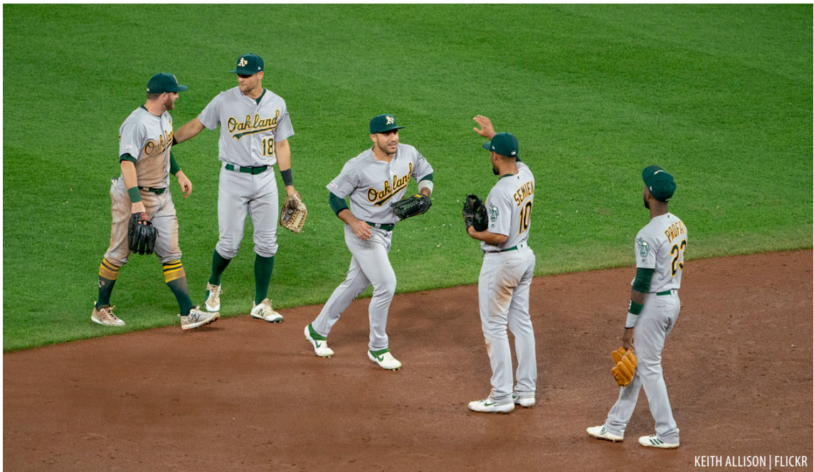
The Oakland Athletics and Tampa Bay Rays are among the teams fighting to clinch a spot in the MLB playoffs this year.

June, where they went on an insane winning run to get back into the hunt for a playoff spot. They do not plan on slowing down as they still have to overtake the Rays in order to get home-field advantage for the one-game playoff. A home wild-card game for the Athletics benefits them greatly, as they currently hold a 48-27 record at the Oakland Coliseum. This advantage was clearly shown in a series at the end of August where they had a home sweep of the almighty Yankees and them feel uncomfortable on the road. This run has been due to strong play from both their lineup and pitching. Their lineup is led by Matt Chapman and Marcus Semien, who have both placed their names at the top of their