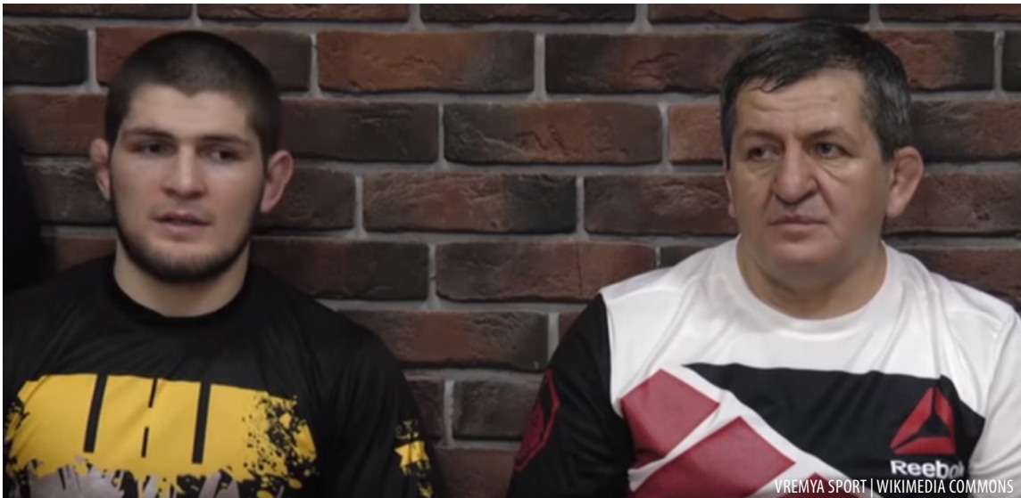
Khabib Nurmagomedov continued his strong run in the UFC lightweight division by defeating Dustin Poirier for another title.

Nurmagomedov now moves to 12-0 in the UFC, tying his lightweight counterpart Tony Ferguson, who is also on an active 12-game win streak. Nurmagomedov is the seventh fighter ever to do so and the second ever to do it in his first 12 fights, the other being Anderson Silva. Nurmagomedov's current 28-0 record now moves him past his fellow Russian icon Fedor Emelianenko's 27-match undefeated streak from 2001 to 2009. Nurmagomedov dominated a man many thought would be his toughest matchup and staked his claim to both the lightweight "greatest of all time" title, as well as the top pound-for-pound fighter. In stark contrast to Nurmagomedov's last fight, there was a great deal of respect for both parties. Post-fight, Nurmagomedov