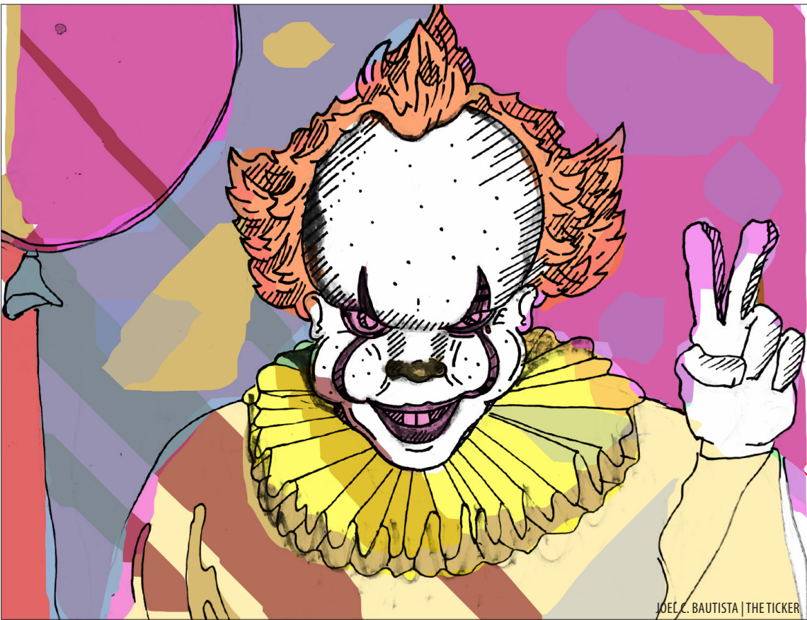
JOEL C. BAUTISTA | THE TICKER

What the first film lacked in fear, the second makes up for