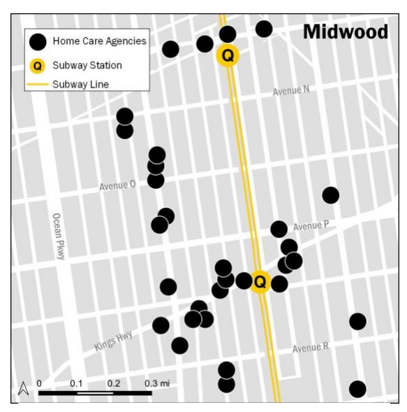
Figure 4.1. Densely Concentrated Home Care Agencies in New York City Neighborhoods<sup>14</sup>

Midwood, Brooklyn: 31 agencies in one square mile