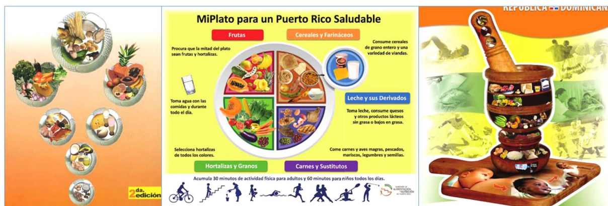
Fig. 1 Pictorial representations for dietary guidelines (from left to right): Cuba (28) , Puerto Rico (27) and Dominican Republic (29)

The guidelines varied in the number of KR for the public (Table 2). The coding process of these KR yielded sixteen distinct themes across the three documents (two diet-based, ten food-based and four 'other'; Table 4). Only the Cuban-DG document addressed dietary patterns as part of the KR, by including diet variety and breakfast. The Cuban-DG link this meal to productivity and worker safety, underscoring the personal responsibility of eating breakfast. In contrast, the DR-DG indirectly include breakfast (as well as lunch and dinner) in the KR related to grains (Table 4), discussed further. Breakfast is not addressed in the PR-DG.