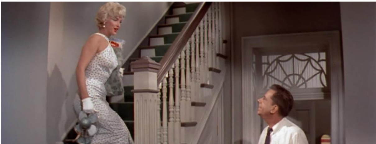
The Girl enters, carrying her sign, a fan

however, compromises his two problems--it keeps him cool but it also brings The Girl into his home, where she lounges legs akimbo right in front of the air conditioner's fan. In The Seven Year Itch , air serves a cooling, desexualizing purpose, but at the same time it works as a stand-in for the sexual act. Wind blowing on The Girl's crotch provides a satisfaction that can be read in two very different ways--as chaste and innocent relief from the heat of a New York City summer, and as a sexual searching for the right size wind. Moving from The Girl's "miserable" $3.95 fan to the "delicious" subway blast, The Seven Year Itch makes Sherman's only chance at sexual success dependent on the size of his AC. He's got it "in every room," and that may be his biggest problem. We can now better understand The Girl's first entrance. Why does she get stuck in the door? Is this a warning that Sherman overlooks in his lust? Or simply a sign that the fan The Girl carries is weak, defective, and in need of replacement? Clearly, we can see now that this is a trap--The Girl's weapon is the wind, her sign the fan.