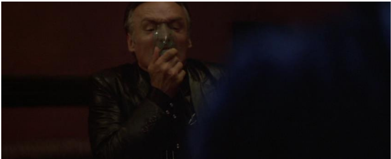
Huffing and puffing Frank Booth as the modern Big Bad Wolf

We see Frank use his mask three times: when he is first introduced raping Vallens, just