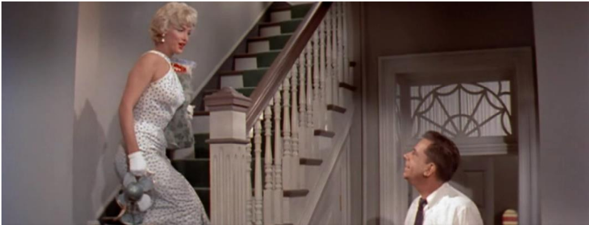
The Girl enters, carrying her sign, a fan

however, compromises his two problems--it keeps him cool but it also brings The Girl into his home, where she lounges legs akimbo right in front of the air conditioner's fan. In The Seven Year Itch , air serves a cooling, desexualizing purpose, but at the same time it works as a stand-in for the sexual act. Wind blowing on The Girl's crotch provides a satisfaction that can be read in two very different ways--as chaste and innocent relief from the heat of a New York City summer, and as a sexual searching for the right size wind. Moving from The Girl's "miserable" $3.95 fan to the "delicious" subway blast, The Seven Year Itch makes Sherman's only chance at sexual success dependent on the size of his AC. He's got it "in every room," and that may be his biggest problem. We can now better understand The Girl's first entrance. Why does she get stuck in the door? Is this a warning that Sherman overlooks in his lust? Or simply a sign that the fan The Girl carries is weak, defective, and in need of replacement? Clearly, we can see now that this is a trap--The Girl's weapon is the wind, her sign the fan.