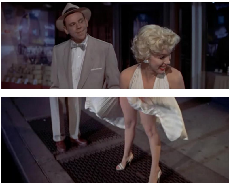
The Girl in the subway grate scene, split

That is a rather graphic way of putting it, but I want to restore some of the sexuality that the film lost due to concessions made to the Hays Code. That most iconic image of Monroe in fact does not appear in full in the film, having been deemed too suggestive, although it was used in the film's poster and other publicity materials. Instead, Wilder had to cut The Girl into two parts, her lower half cleaved from her upper half. But in case we missed it, the film immediately