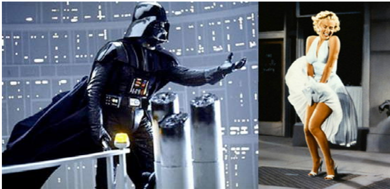
Darth Vader and Marilyn Monroe (copyrights 1980, Lucasfilm and 1955, Twentieth Century-Fox Film)