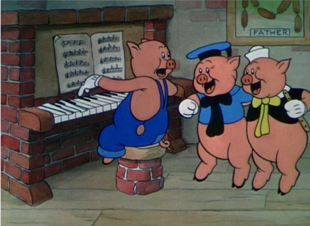
The image of Father in Three Little Pigs (copyright 1933, Walt Disney Productions)

Practical Pig plays the Cassandra throughout, and while the bulk of the short film focuses on demonstrating the truth of his prophecy that “you’ll be sorry when the wolf comes through your door,” the real warning he makes can be read in the brick and stone material of his home. The film humorously plays with how well and thoroughly Practical Pig has constructed his house; we see that not only are the walls and chimney made of brick, but that he also has a brick piano and a brick bed. As with the sausage links, the overdetermined nature of the bricks in his home simultaneously cover over and express Practical Pig’s fear. If my father has become a link of sausages, Practical Pig seems to suggest, then that is a fate I must avoid at all costs, and so I will do everything that I do in the firmest manner possible. In this, Practical Pig’s obsession with building his house of brick and stone is less a mark of his maturity and more an expression of his